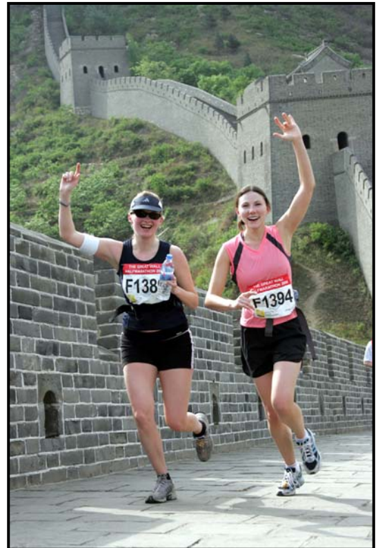
The Imperial Run

Please be aware that neither your tour package nor participation in the Great Wall Marathon will be confirmed until your fully completed entry has been received by your tour operator and this at latest by 15 th March, 2010.